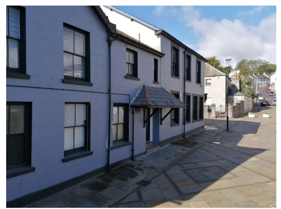
Photograph of site's front elevation

The site comprises a two-storey building which occupies a relatively prominent position due to its proximity to the junction of Park Street and Tondu Road - two main roads within/ surrounding Bridgend Town Centre. As indicated above, prior to its change of use to provide short-term lets, the site has historically been used as a public house, as well as other uses within the A3 Use Class.